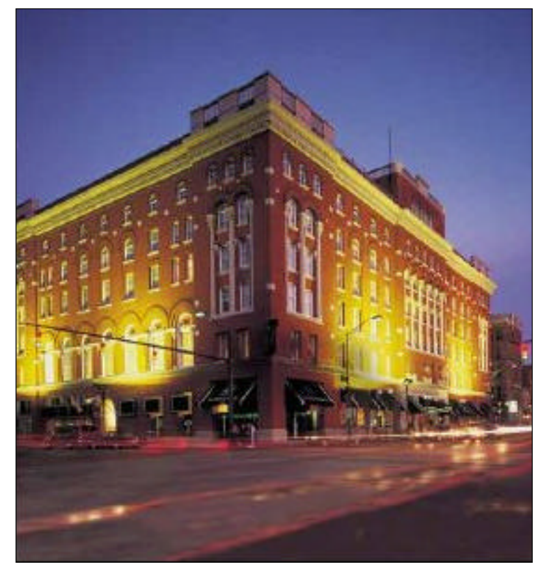
Exterior view of hotel