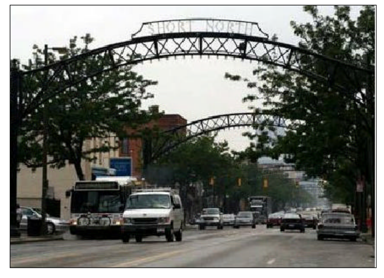
View of the Short North