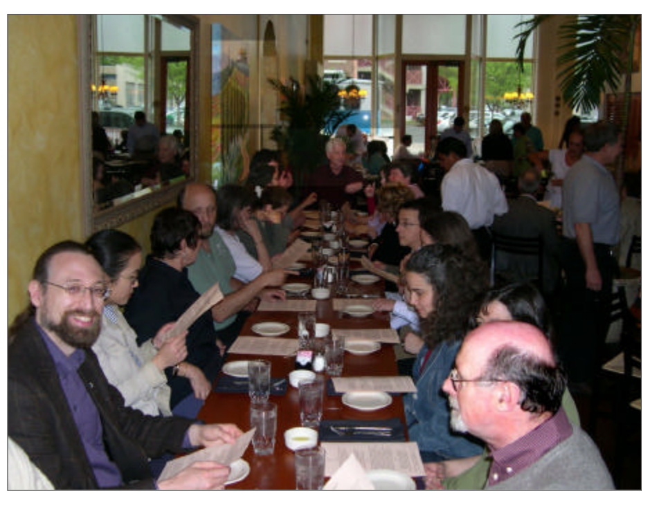
Board Members Enjoy Dinner at Cafe Luna.

The Executive Secretary, first and foremost, assists the President and the Board in the smooth functioning of ACRA. The Executive Secretary takes care of the mundane tasks of collecting the mail, moderating Members Only and ACRA-L. He (or she) also holds onto the conference display and carries or sends it to conferences. The Executive Secretary is also the point of contact for members and the public. I handle simple things, such as answering questions on how to get into the members section of the web site or directing people to the information about ACRA for which they are looking. Anything of substance gets sent along to the appropriate person, whether that is the President, a committee chair, the Board, or one or more of the officers. What the Executive Secretary does not do is make decisions for ACRA. All decisions are made by the President, the Executive Committee, and the Board. Under the current structure, the Executive Secretary is an assistant first to the President and then to the board.