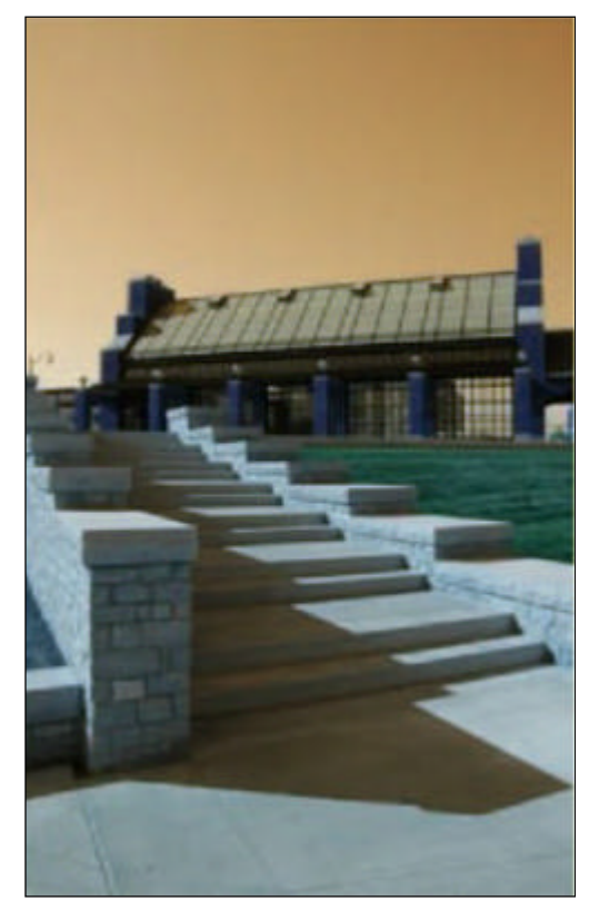
North Bank Pavilion